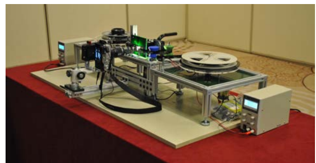
The AACA Library's Film Scanner

Please take advantage of the many opportunities you have for exposing our club, and make use of the promotions national headquarters provides for you. Thank you for your unending efforts to bring the enjoyment of AACA to others. You, along with 59,856 others, are the most powerful source we have for getting the job done.