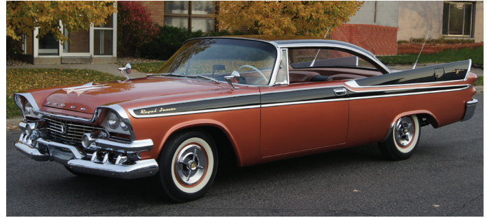
1958 Dodge Regal Lancer Randy & Sally Guyer, Minnetonka, Minnesota

This California car was originally restored 30 years ago. It was subsequently re-restored in 2014, still retaining all of its original drivetrain, body parts, and trim. For 1958, the Dodge line-up of cars was topped by a spring-time addition, the Regal Lancer. It was available until year's end and only as a 2-door hardtop with special colors, exterior trim, and interior. Four color combinations were available from three colors: bronze/white accents, bronze/black accents, black/bronze accents, or white/bronze accents. All featured "Regal Lancer" nameplates on the fenders and heavy eyebrow trim. The sporty exhaust tips and extra chrome side strips running the length of the car, along with the special taillight crowns and "toothy" grille, combine to make the Regal Lancer a stand-out.