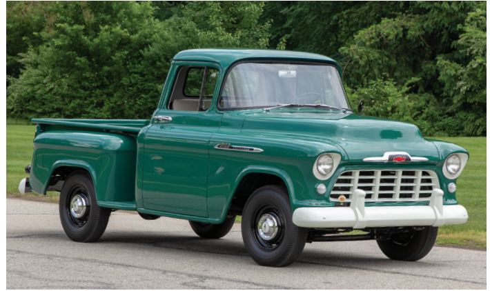
1956 Chevrolet 3100 Steven & Theresa Maveal, Alpena, Michigan

The Maveals’ 1956 Chevrolet stepside is painted “723” Forest Green, with the standard interior color of light/dark grey. Its 235cid Thriftmaster inline 6-cylinder engine produced 140 horsepower, and is coupled with a 4-speed manual transmission. Sold as a base model costing $1,619, it came with a single tail lamp, no rear bumper and no turn signals. NOS accessories installed during restoration included a turn signal kit, behind-the-seat tool tray, an in-dash emergency brake warning light, chrome door handle guards, windshield washer kit, AC oil filter kit, fuse junction block, glove box lamp, underhood lamp, and front bumper guards. The Maveals purchased the truck in 2001 from the 3rd owners in Hillsboro, Oregon, who had the truck since 1977. Their idea was to turn it into a driver, but later decided to take it apart for restoration, using a GM assembly manual, salesman’s data book, and a local body man. The restoration was completed in 2011.