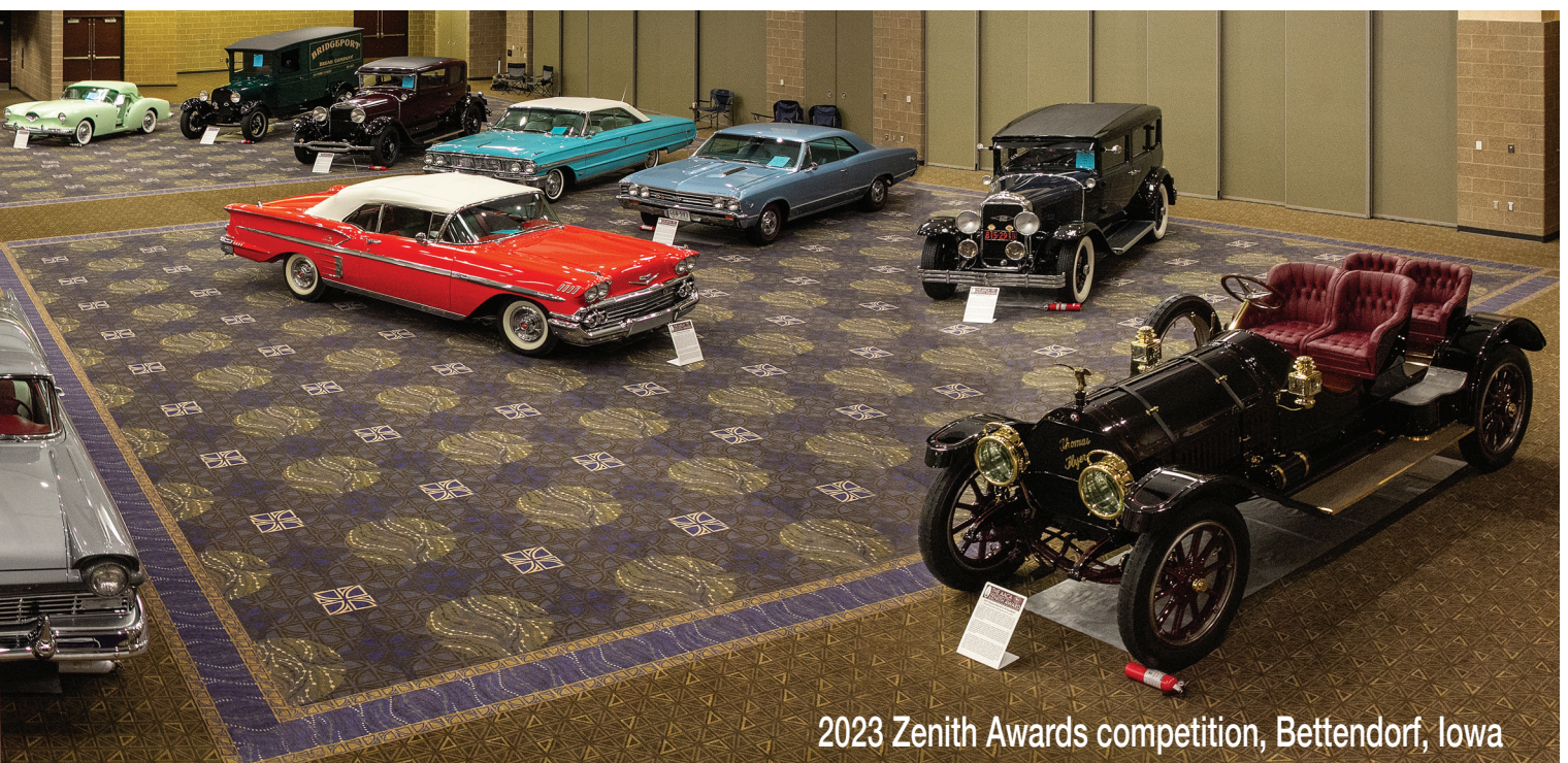
2023 Zenith Awards competition, Bettendorf, Iowa