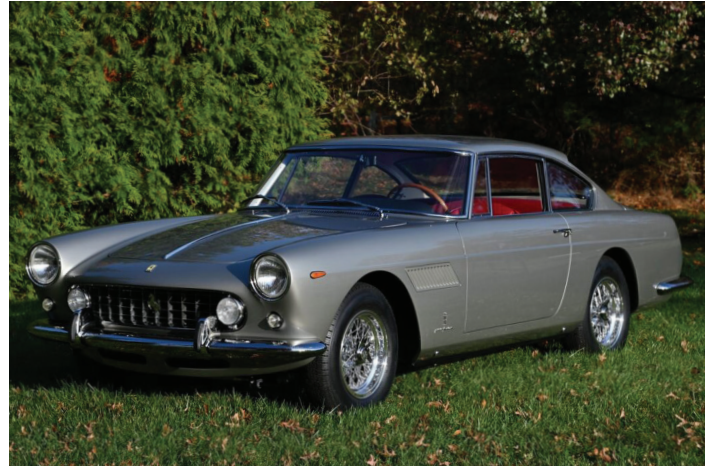
1963 Ferrari 250 GTE Series II Lamot J. du Pont, McLean, Virginia

The 250 GT ( granturismo ) 2+2 was the first four-seater high-production Ferrari to be produced and the first to have a back seat large enough for an adult. It was introduced to the public, not at one of the major salons, but rather as the "course car" for the 24 Hours of Le Mans in 1960. Fitted with the Tipo 250 single overhead camshaft 3-liter V-12, topped with three Weber 40 DCL 6 carburetors, the 4-seater had a top speed of 150mph. A total of 955 were built from 1960 to 1963, with just 348 of those being the Series II. This model featured a four-speed gearbox plus overdrive.