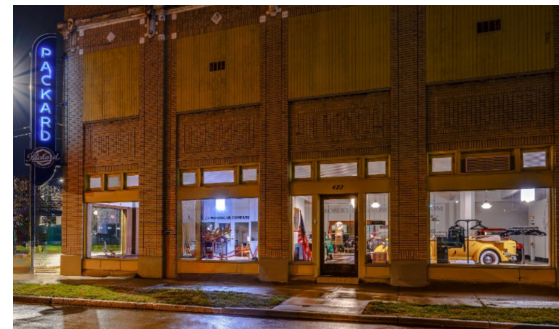
America's Packard Museum